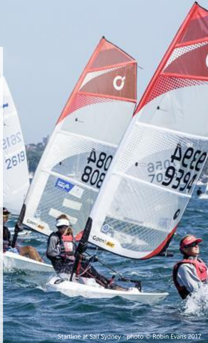
Startline at Sail Sydney